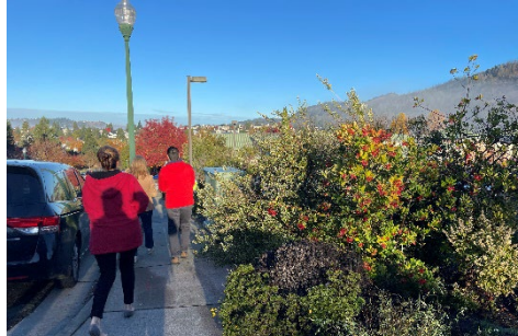
Bushes blocking driveway sightlines