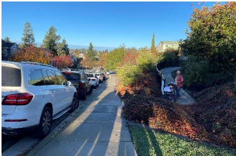
Pathway west of school site