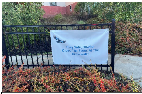
Existing signage (end of pathway)