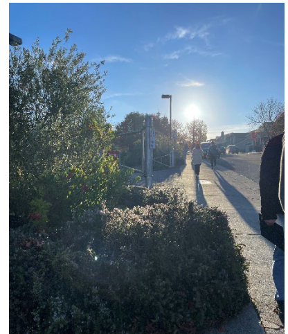
Bushes blocking driveway sightlines