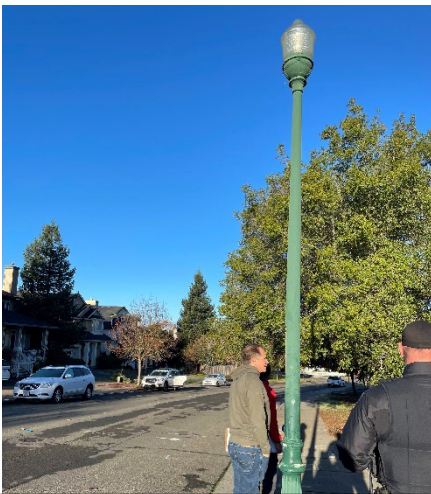
Possible location of speed limit sign (Great Heron, heading west)?