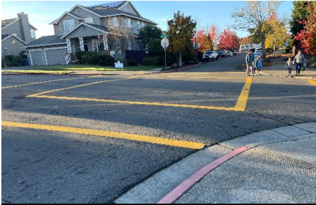
Intersection of Great Heron & Snowy Egret