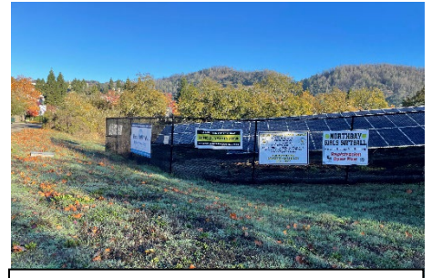
Existing signage (Great Heron, west of site)