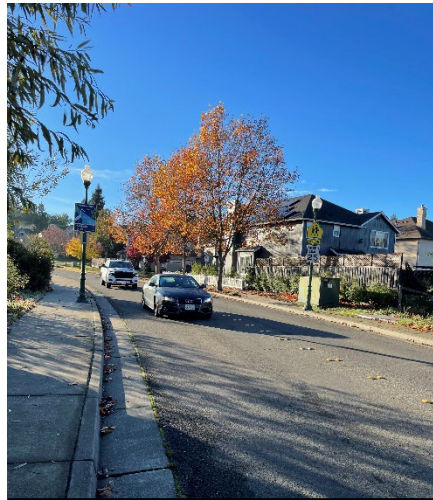
Existing speed limit sign (Great Heron, heading east)