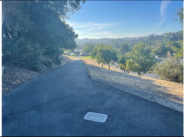
The pathway/hill PJH pedestrians or bicyclists travel from North Webster to the school