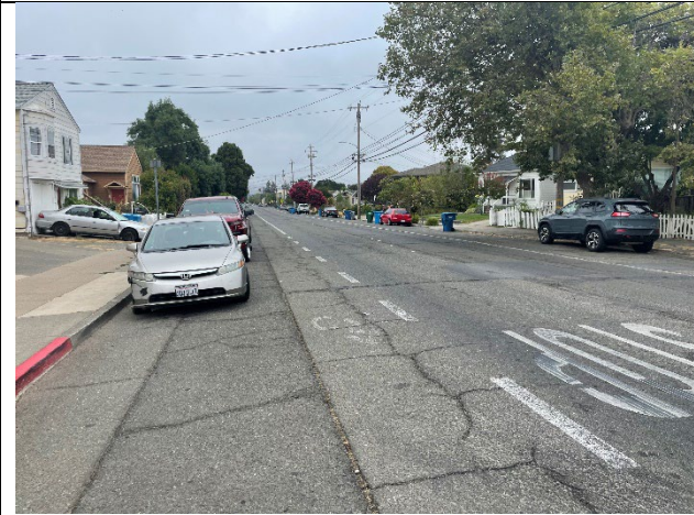
Continue bike lane improvements on Western east of N. Webster