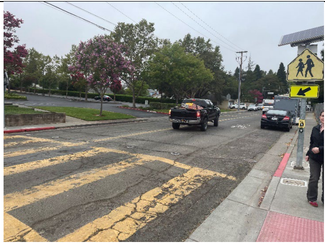
Crosswalk on north side of Valley Vista campus, needs refreshing & sign also faded/cracked