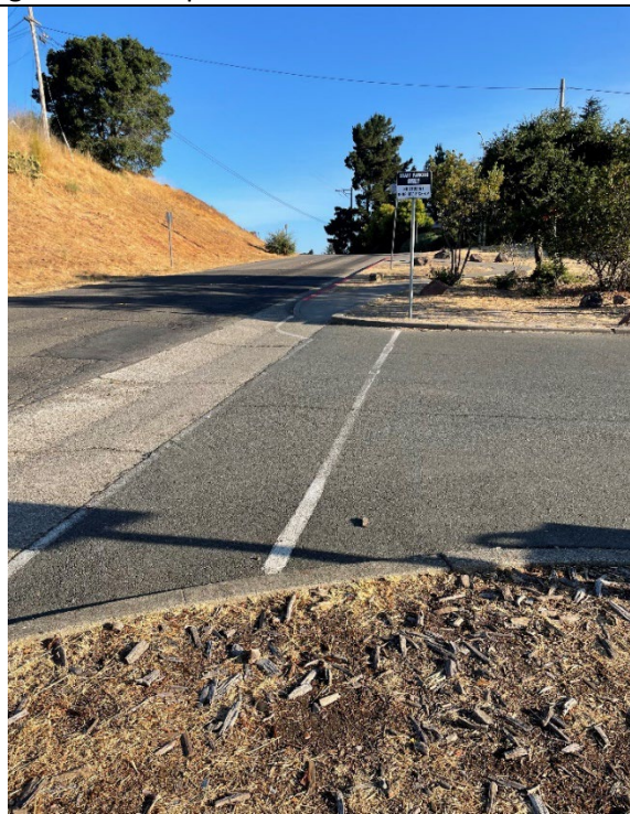
City bus stop on Bantam pictured above, as well as the school driveway kids need to cross (without a crosswalk) to get to campus.