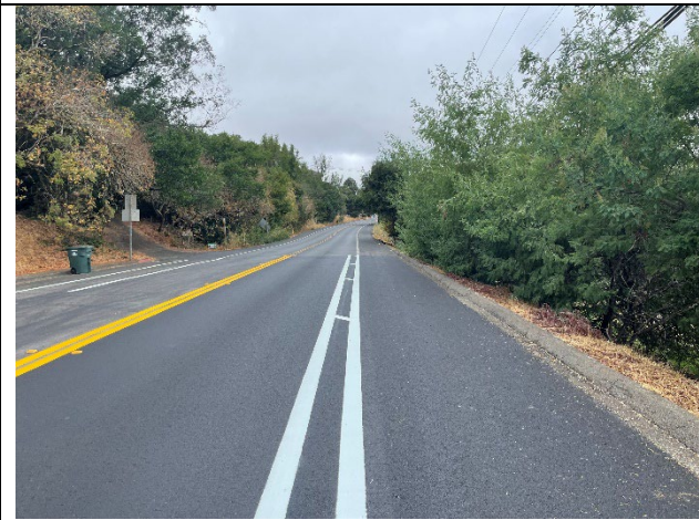
Western Ave, note change in bike lane at City limits