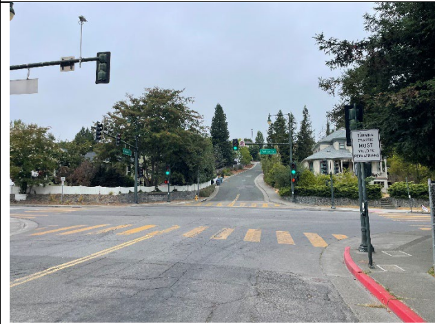
North Webster & Bodega – improve with bulb-outs, refresh crosswalks, double check signal timing.