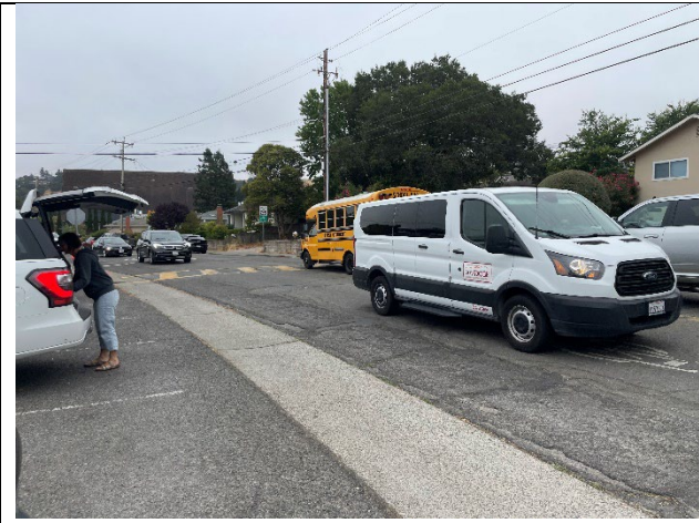
Drop off traffic in front of Valley Vista