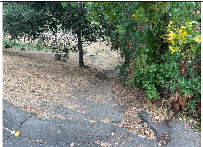
Access to PJH from Western Avenue, through the baseball field – consider improving for safer access?