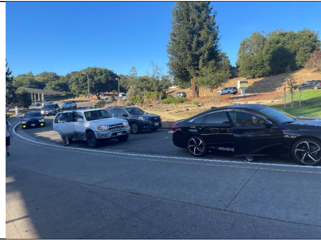
Drop off loop, Petaluma Junior (white truck is in faded bus zone)