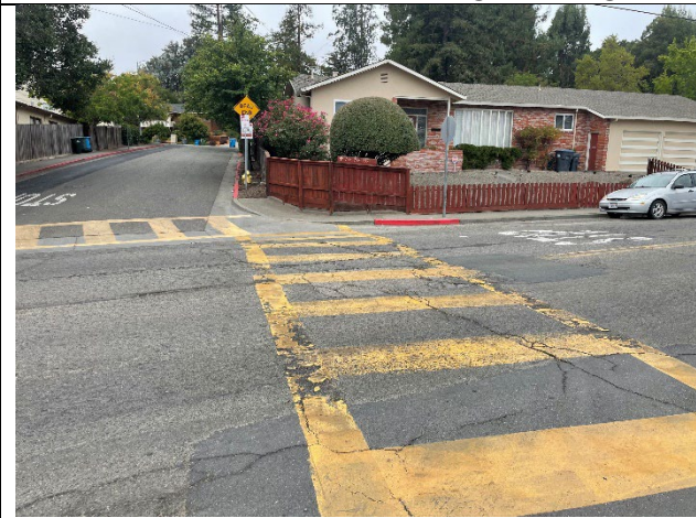
Crosswalk at N. Webster & Townview needs refreshing, consider conversion from 3-way stop to removal of stop sign on N. Webster and replacing with a pedestrian activated signal, RRFB, raised crosswalk and/or island.