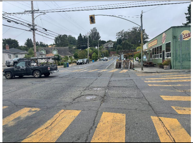
Western & North Webster