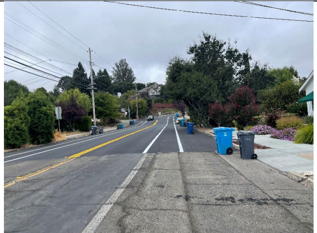
New bike lanes on Western