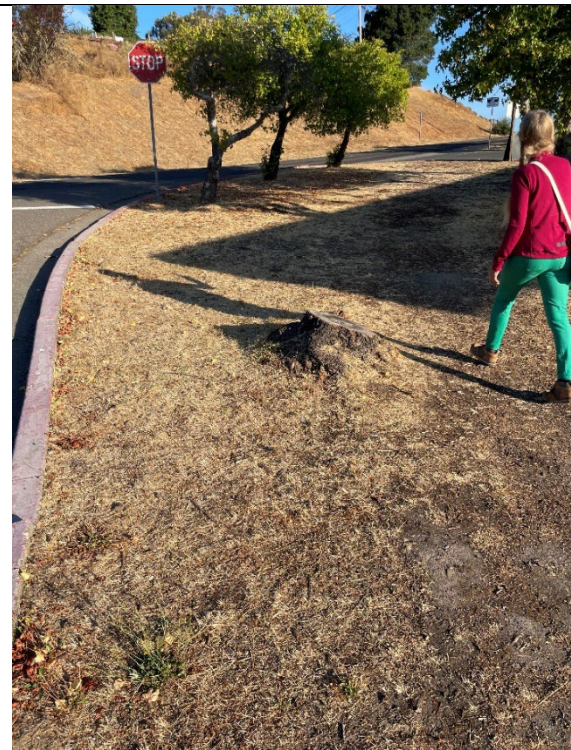
Walking across PJH grassy area on Bantam, to get to city bus stop