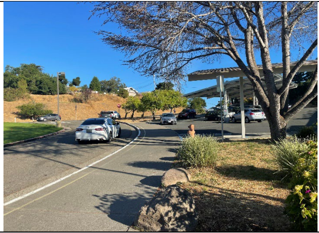
Another view of drop off loop – where sidewalk ends is the grassy area that kids need to walk through to get to bus stop.