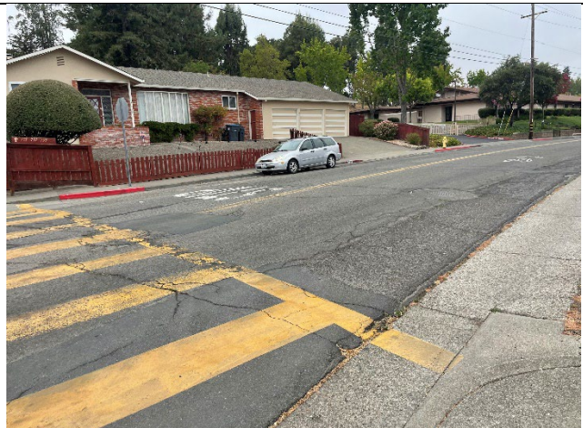
Add a stop bar at N. Webster & Townview heading south