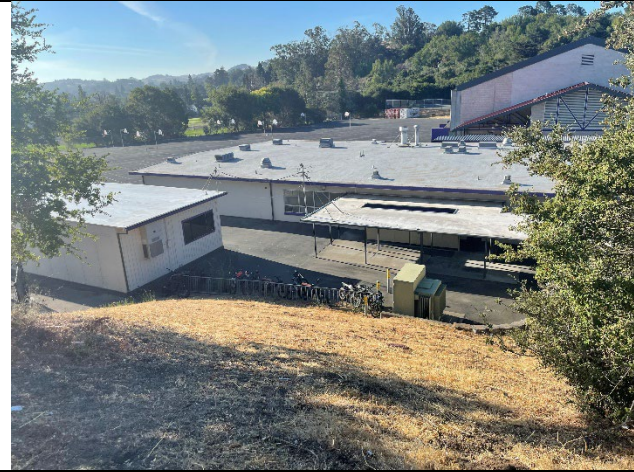
Bike racks on lower blacktop at PJH – about 10 bikes parked, a few are electric