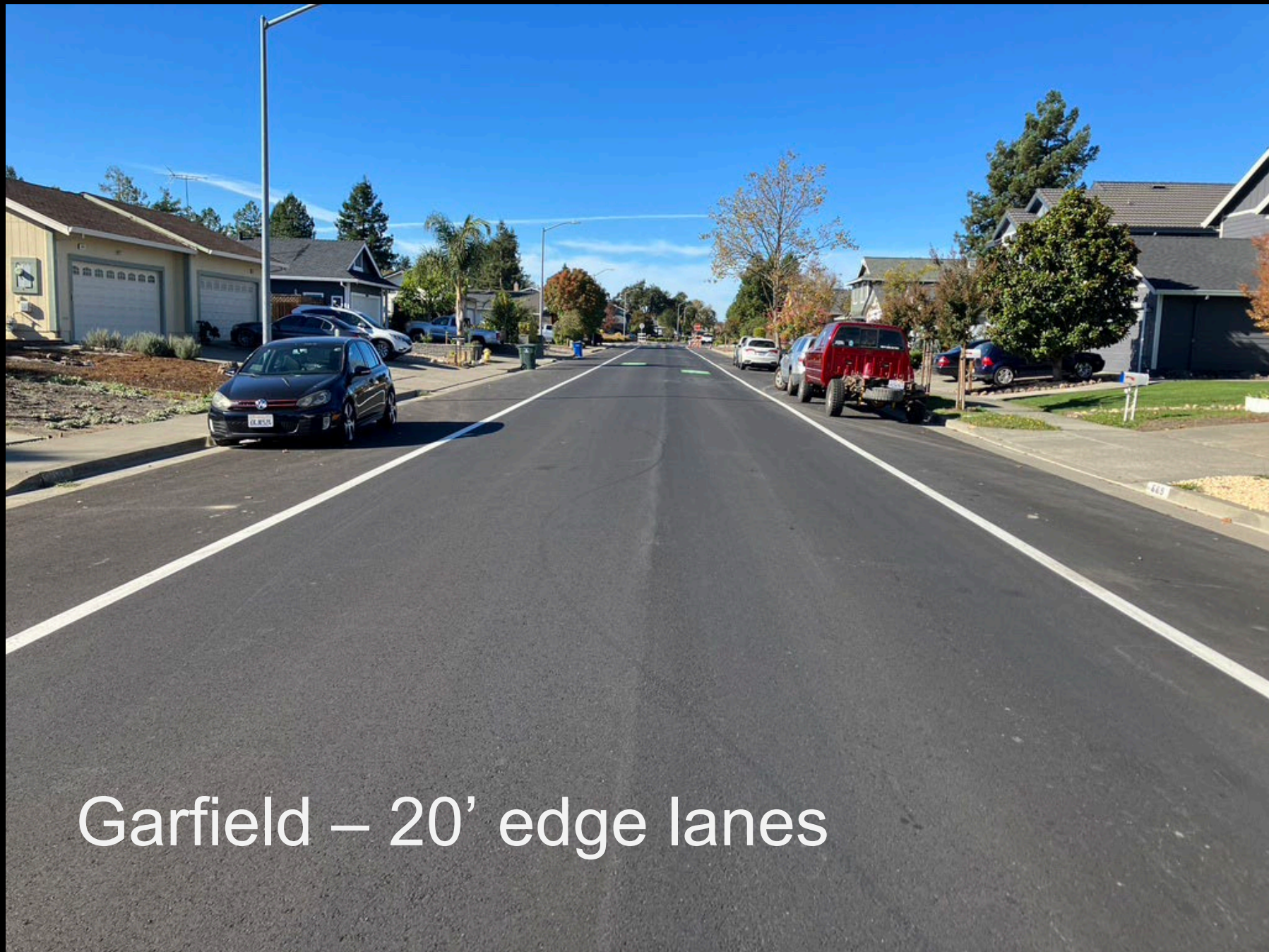
Garfield – 20' edge lanes