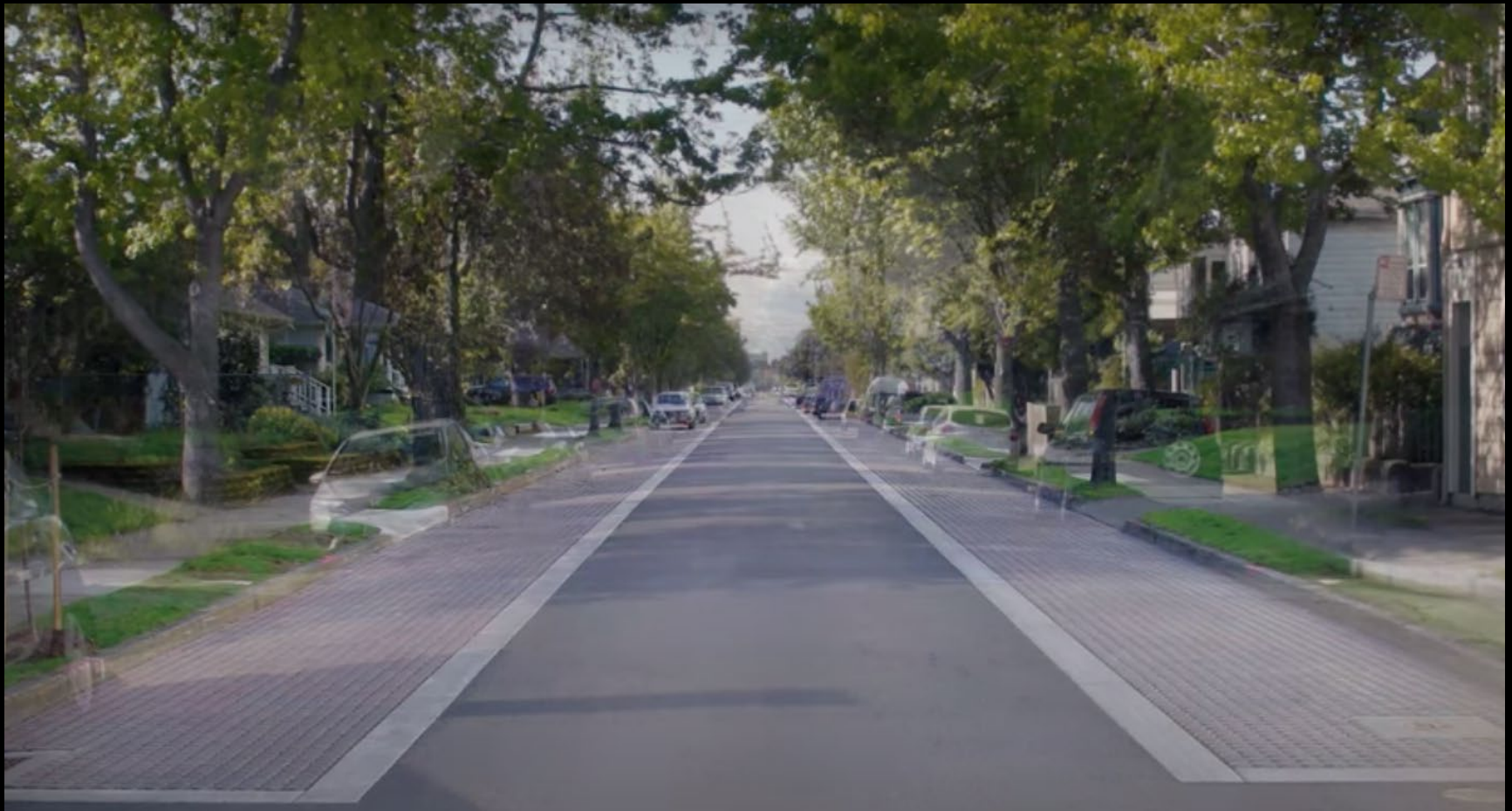
Edge lane -- after