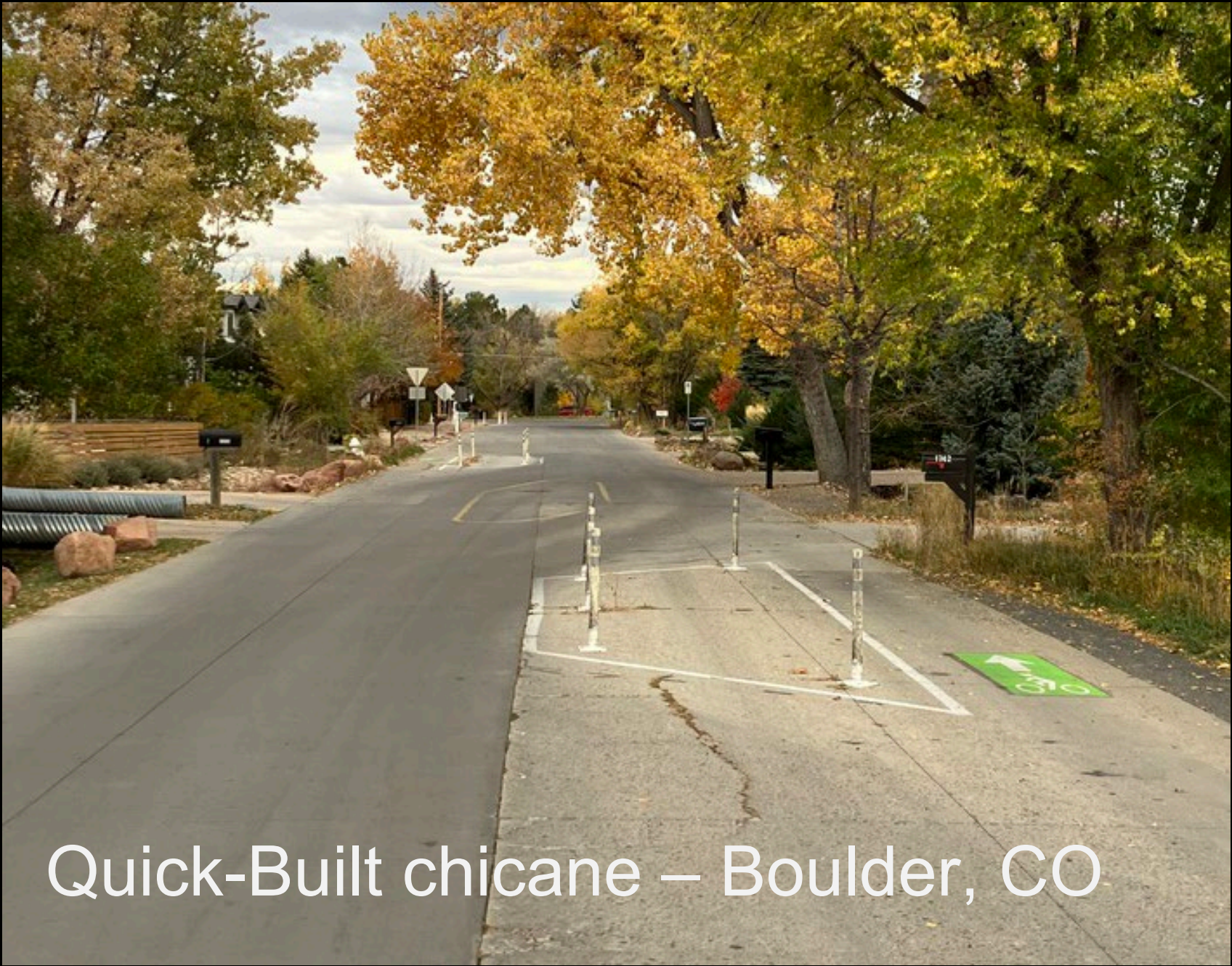
Quick-Built chicane – Boulder, CO