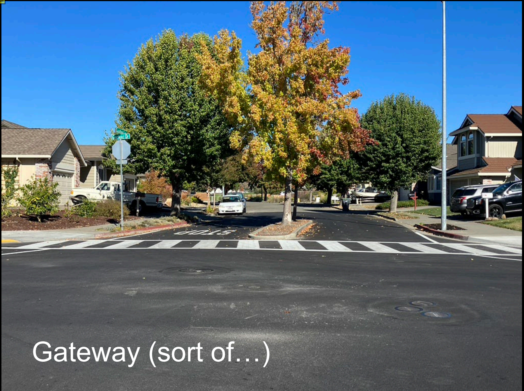
Gateway (sort of...)