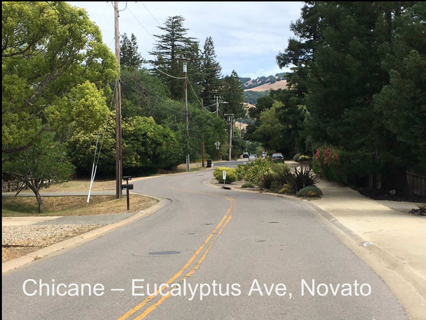
Chicane – Eucalyptus Ave, Novato