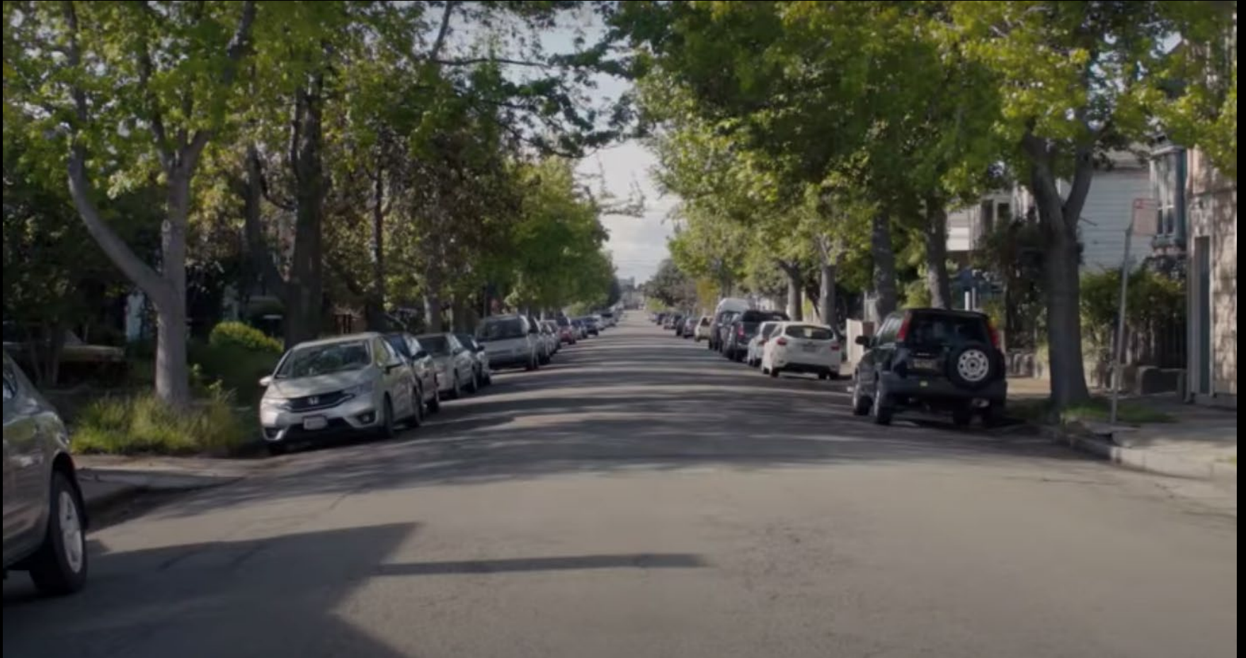
Edge lane -- before